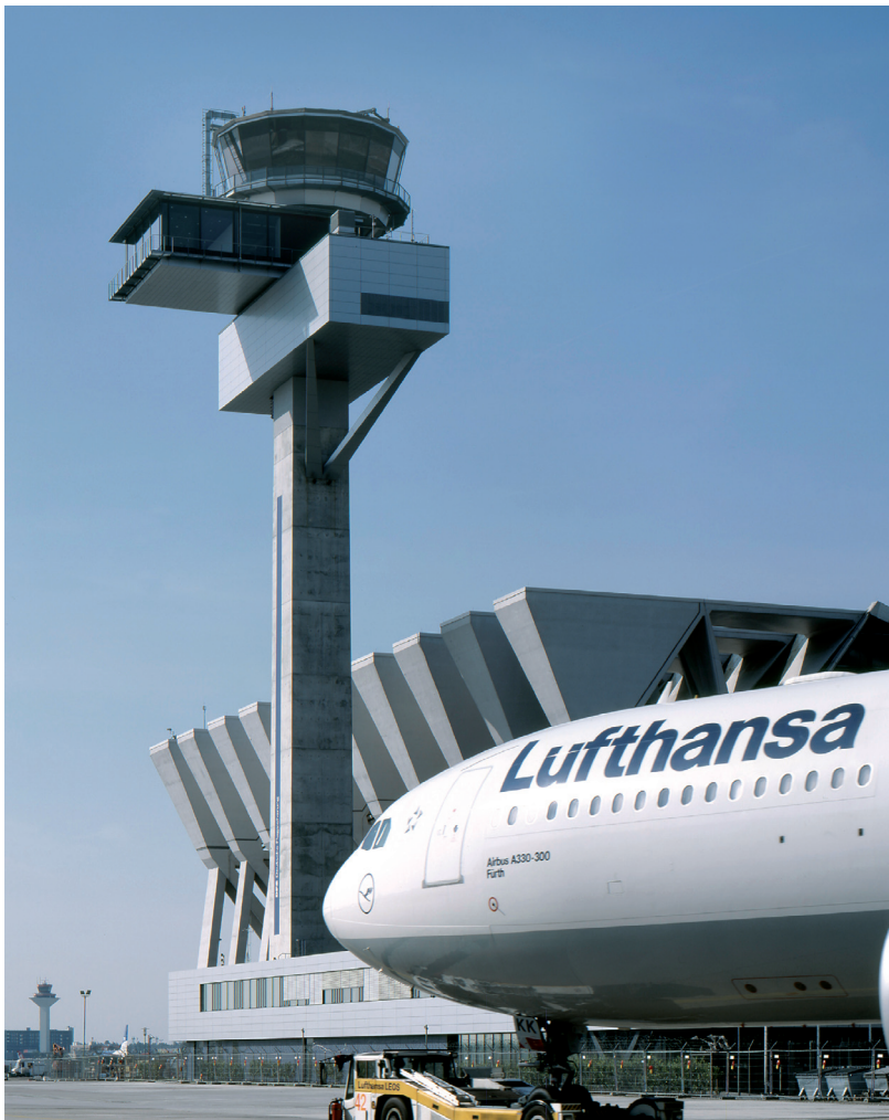
The new tower at Frankfurt Airport

During the night of 13 to 14 June 2011, two weeks earlier than originally scheduled, the new control tower at Frankfurt Airport started operations.